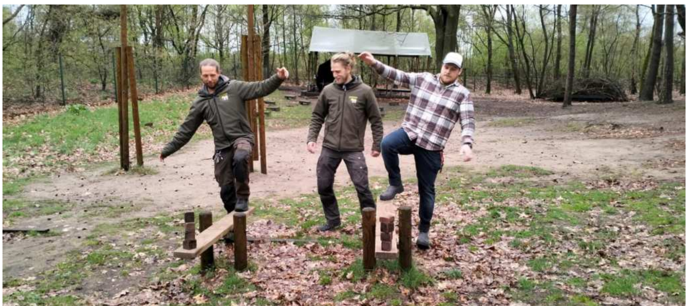
Keep switching until every participant has had a turn